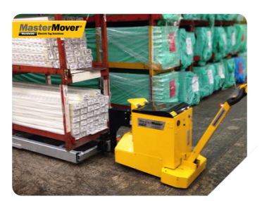
Plastic and Metal Extrusion