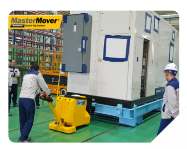
Engine, Pump and Generator